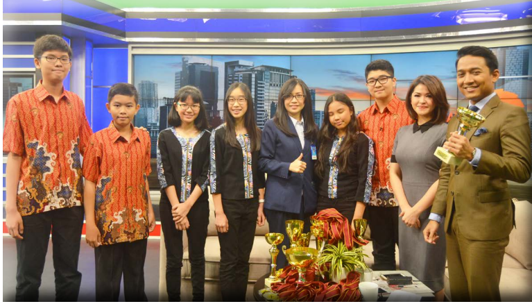
TALK SHOW AT "SELAMAT PAGI INDONESIA" METRO TV

Round, over the summer. There were three venues to choose from: Athens, Greece; Hanoi, Vietnam and Cape Town, South Africa. After much consideration, we decided to participate in the Athens Global Round, which was held from July 18 - 23. Upon our arrival in Athens, we were immediately struck with the heritage of the city. The entire city, not just the Parthenon, showed how it was filled with the spirit of competition, for which it is so famous. When we entered the theatre to compete, we were greeted by more than 1,500 scholars, from over 40 different countries, from all over the world.