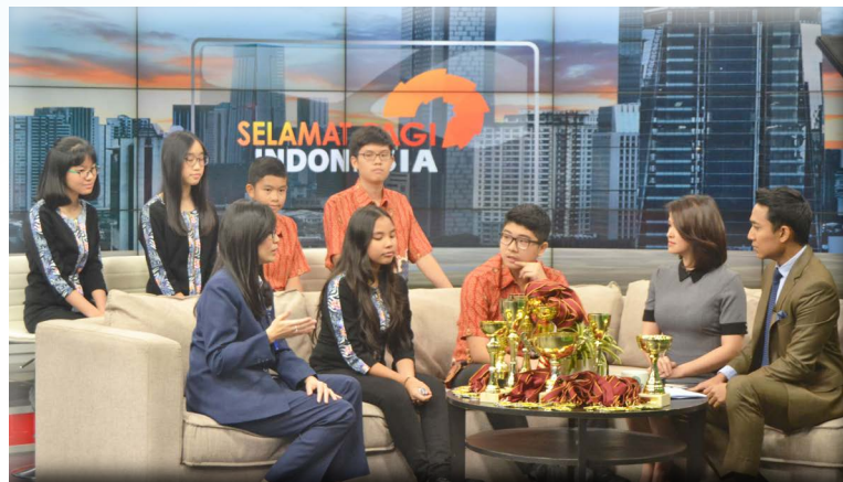
TALK SHOW AT "SELAMAT PAGI INDONESIA" METRO TV

theme remained the same, all parts were significantly more difficult and challenging in the Global Round. Additionally, we went face to face with many top scholars around the world. Despite the heat, nervousness, and anxiety, we worked together and pushed each other to give every challenge our best shot.