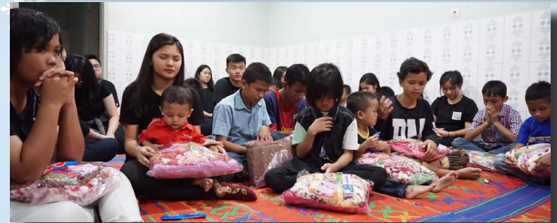
Panti Cahaya Kasih

The visit to Panti Cahaya Kasih was intended to establish fellowship with the local children, and distribute food and supplies. The latter were the result of 20% gross profit from the 12 weeks of running business simulation models. In that assessment task, the students were to come up with a concept, start up a business, and gain real life sales, as well as apply what they had learned to the business they own. The supplies offered to the orphanage varied from towels, blankets, and hygienic products, to snacks for the children to enjoy. As followers of Christ, the students were also blessed with an opportunity to lead the worship service and share the Gospel.